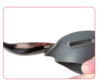
Use the back of a spoon to carefully roll the edges