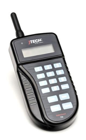
Table Scout Rechargeable handheld table status updater.