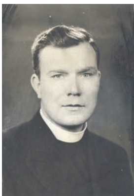
Date & Place of Birth: January 9, 1909; Attymas, County Mayo, Ireland