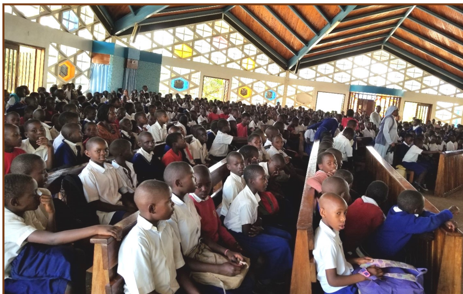
A gathering of a student chapter of the Father Peyton Prayer Guild in Fort Portal, Uganda.