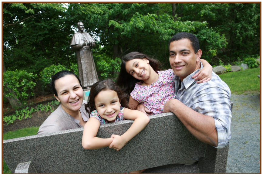
A family visits the statue of Father Peyton while on the Rosary Walk at the Father Peyton Center.