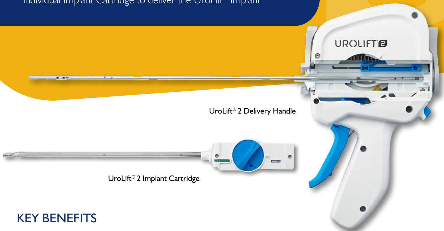
UroLift® 2 Delivery Handle

Typically one Delivery Handle per procedure, using an individual Implant Cartridge to deliver the UroLift® Implant