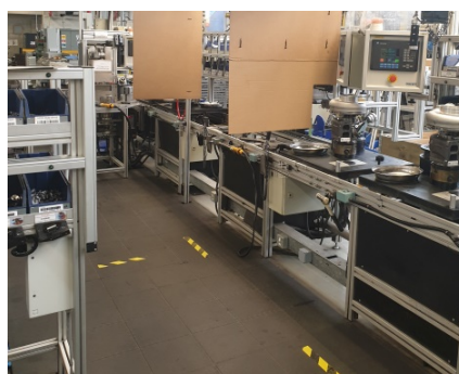
Temporary board dividers