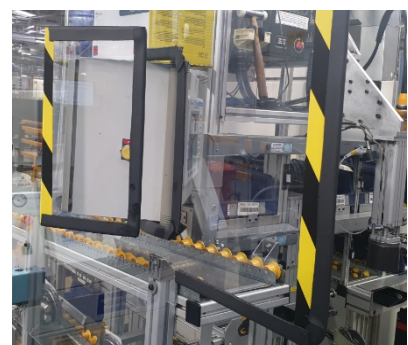
Perspex dividers with edge marking