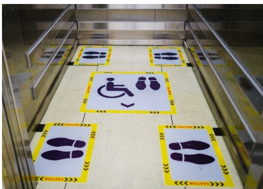
Example lift practices