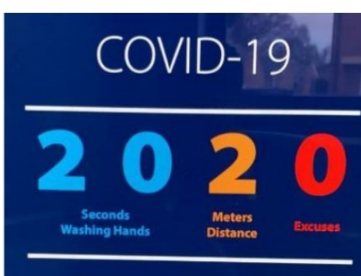
Signage to promote hygiene and social distancing measures