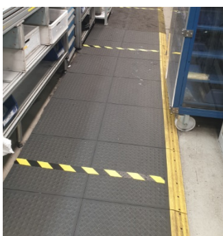
2m floor markings