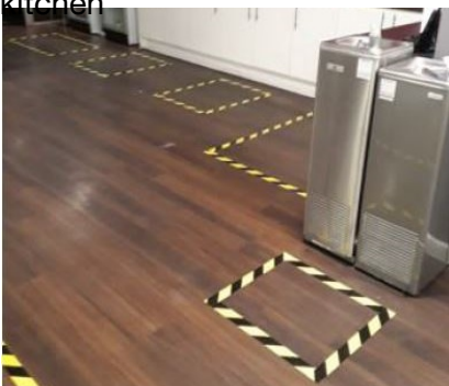
Distancing markers in a kitchen