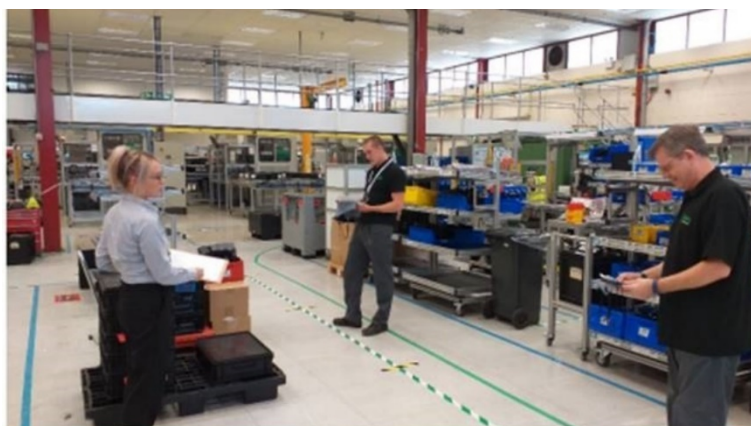
Shift briefing with social distancing