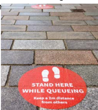
Signage to promote social distancing