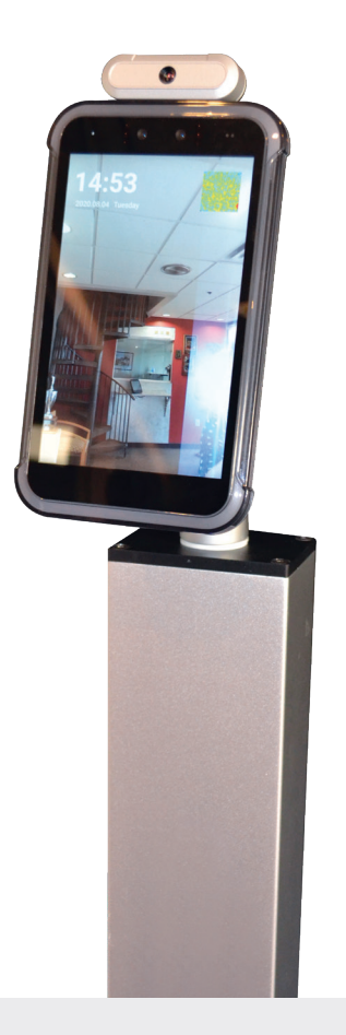
PDI-TK8, 8"LCD, Thermal Camera Temperature Screening Tablet