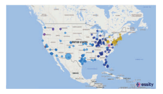
Representation of various installments in different locations & highlighting different vendors*