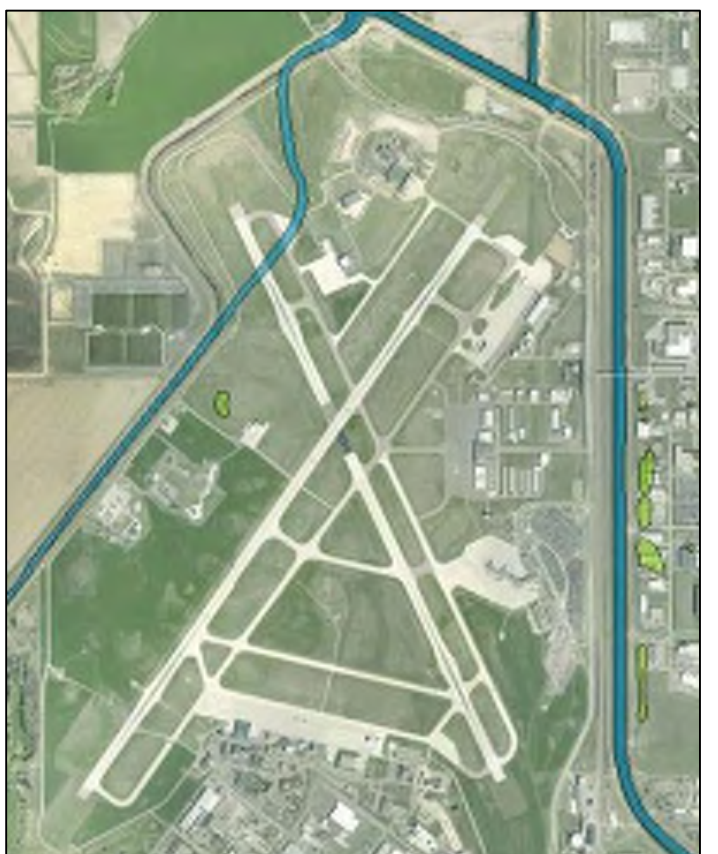
Figure 8-3 – USFWS National Wetlands Inventory Map

Analysis of the National Wetlands Inventory (NWI) data indicates the presence of wetlands within the study area. Exhibit 8-3: USFWS National Wetlands Inventory Map identifies the current NWI data for the Sioux Falls Regional Airport. There are few identified wetlands within airport property. Wetlands in the area would serve a variety of functions, including groundwater recharge, flood control, sediment removal, and nutrient cycling. A wetland delineation and coordination with applicable resource agencies may be necessary prior to project implementation to further analyze the impacts the proposed improvements would have on wetlands. Further analysis is required for future projects.