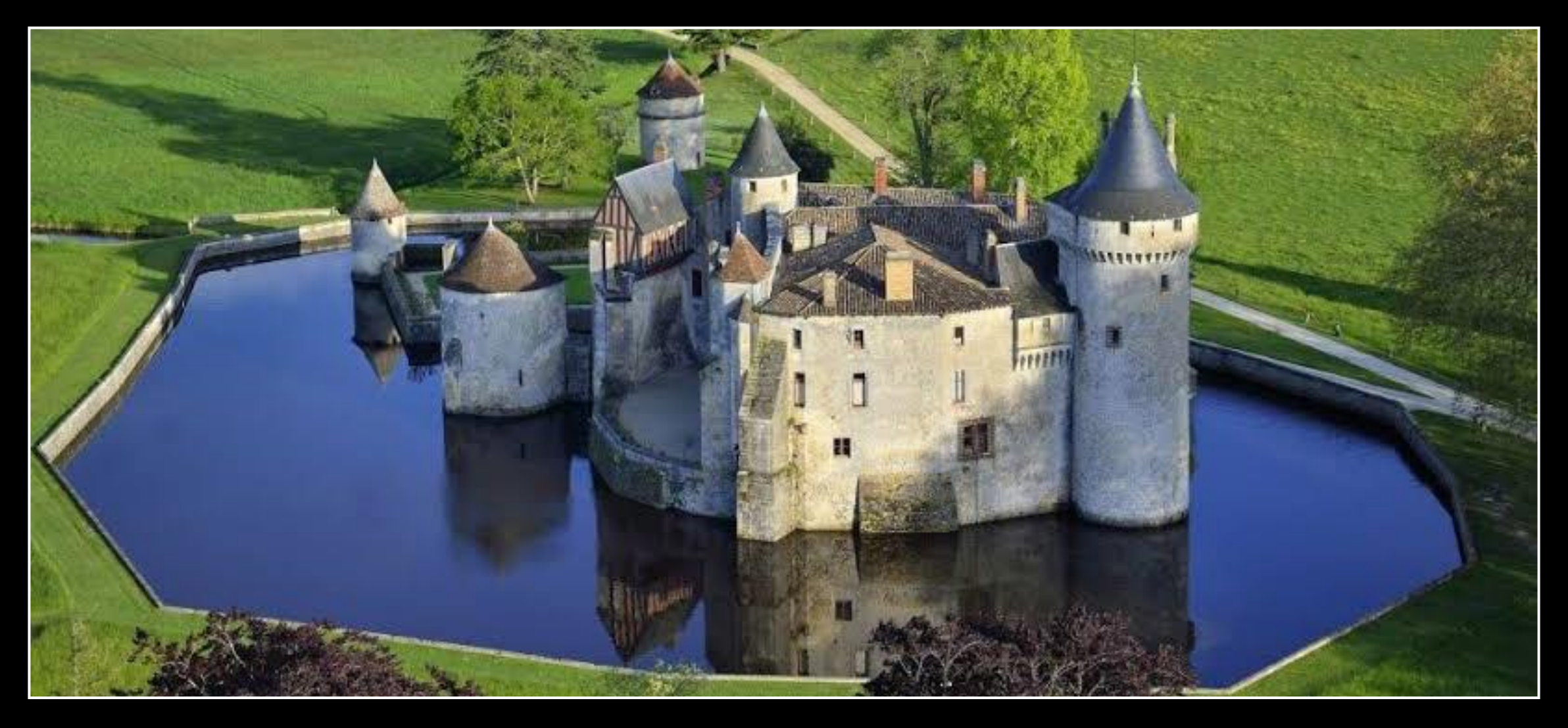
Protecting Family Wealth with succession, asset protection and bloodline planning