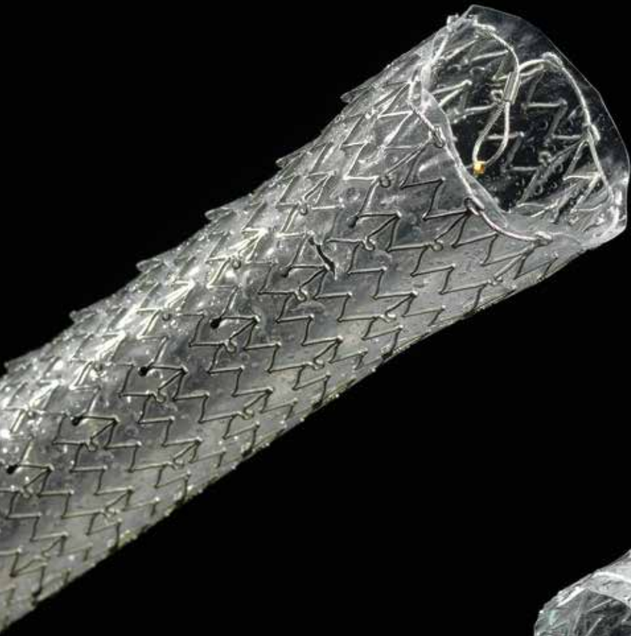
ALIMAXX-ES™ Fully Covered Esophageal Stent