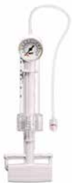
BIG60® 60 mL inflation device