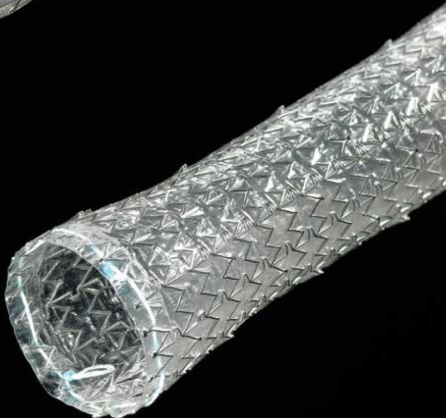
EndoMAXX® Fully Covered Esophageal Stent