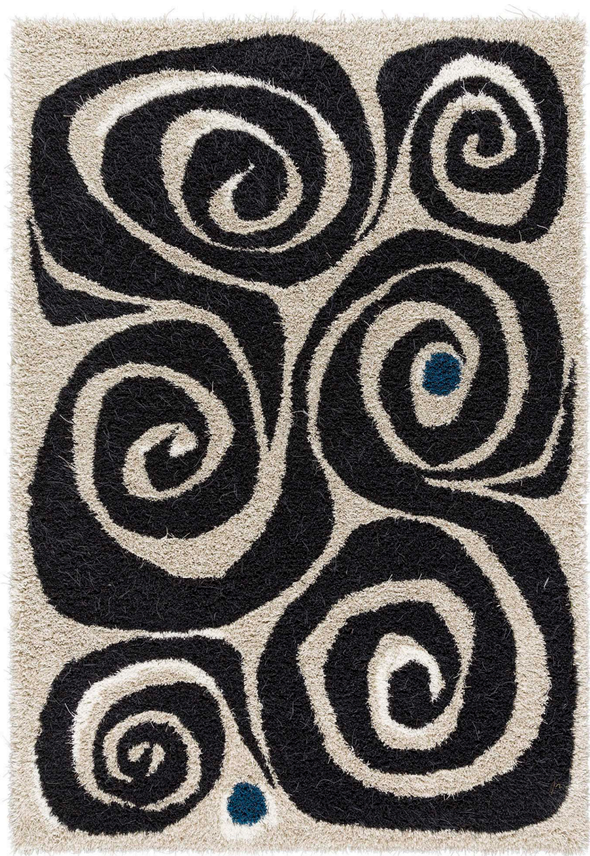
Rug 170x240 cm

Showrooms in MILAN | NEW YORK | STOCKHOLM | GOTHENBURG