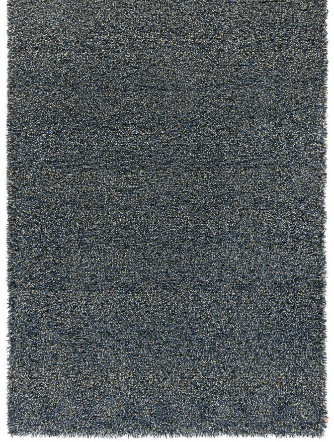
Rug 170 x 240 cm, Coconut Crisp 811