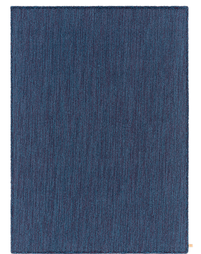
Rug 170x240 cm, Playful Purple 621