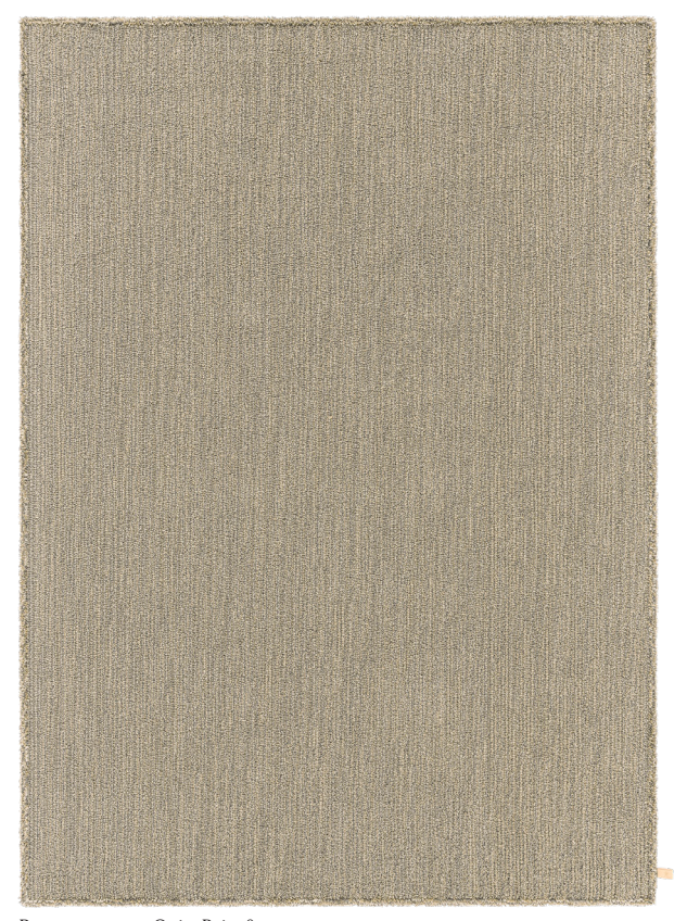
Rug 170x240 cm, Quiet Beige 800