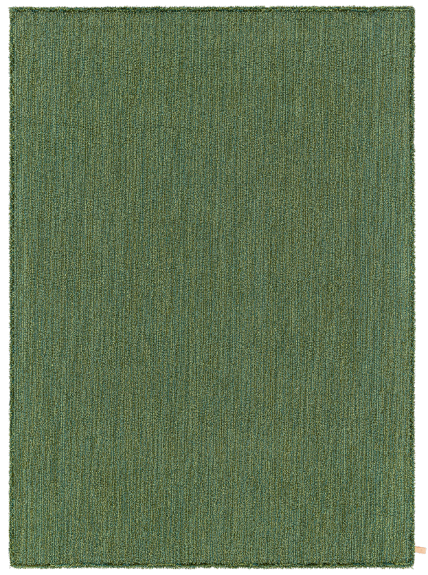
Rug 170x240 cm, Cool Green 300