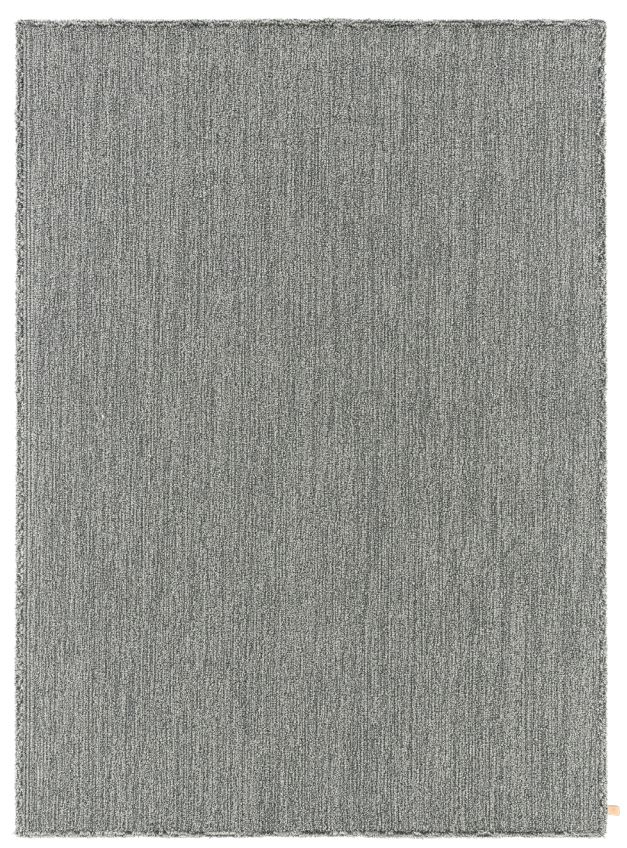
Rug 170x240 cm, Harmonic Silver 501