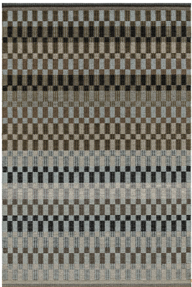
Rug 165x240 cm, Earth 200