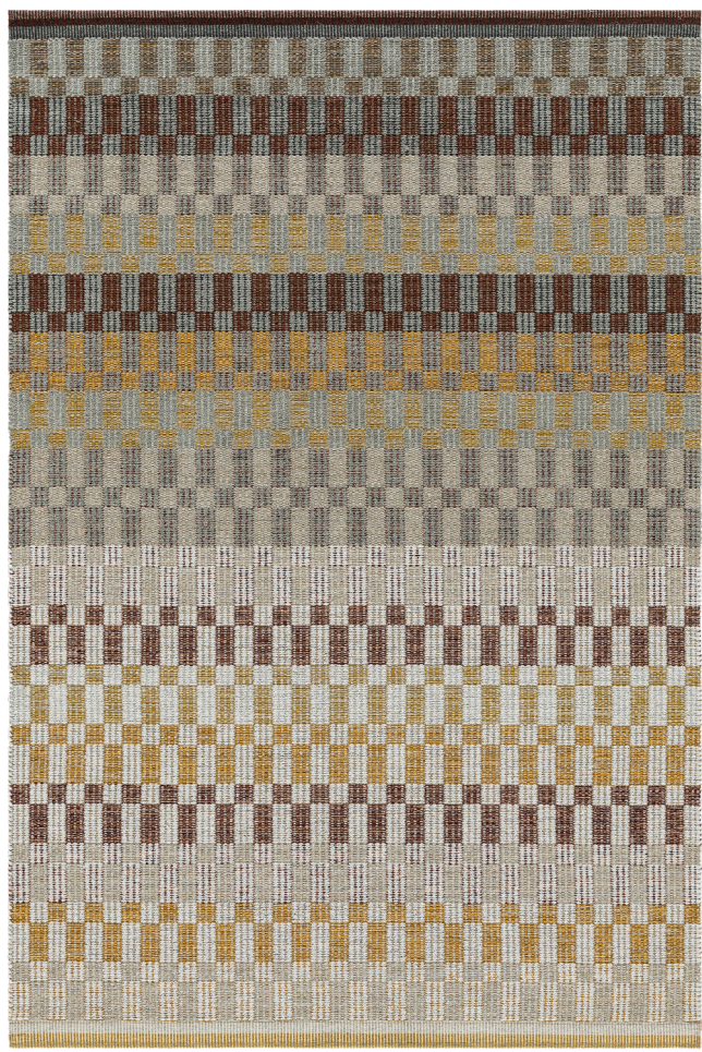
Rug 165x240 cm, Sun 400