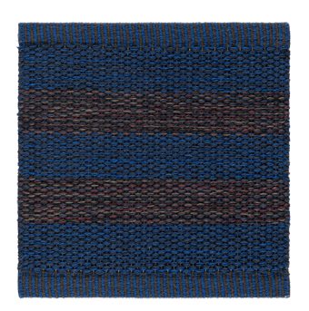
Indigo Dream 221