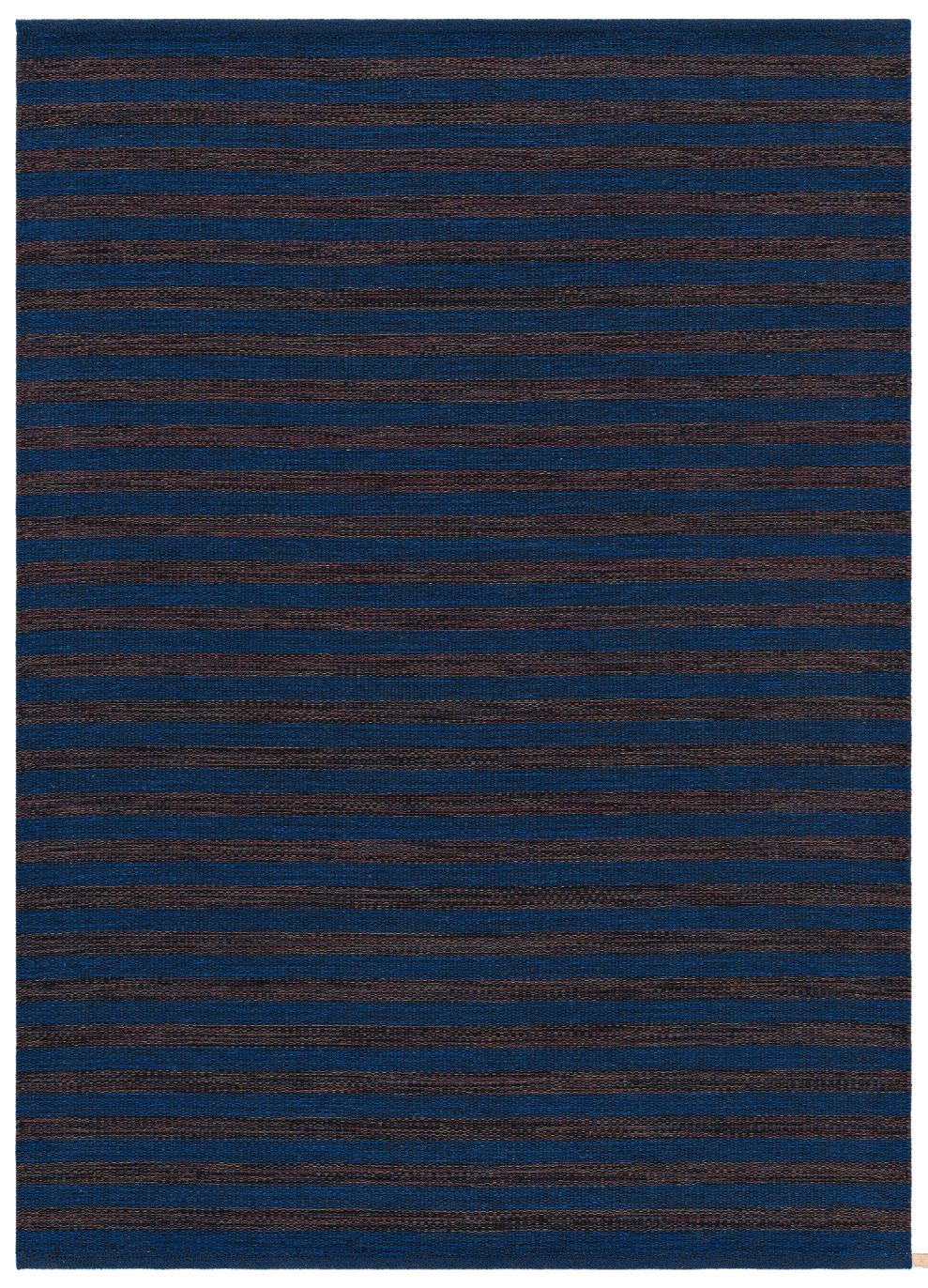
Rug 160x240 cm, Indigo Dream 221