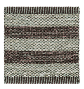
Silver Plum 560