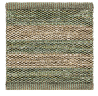
Bamboo Leaf 381