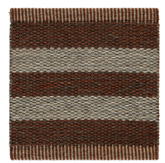
Red Clay 753