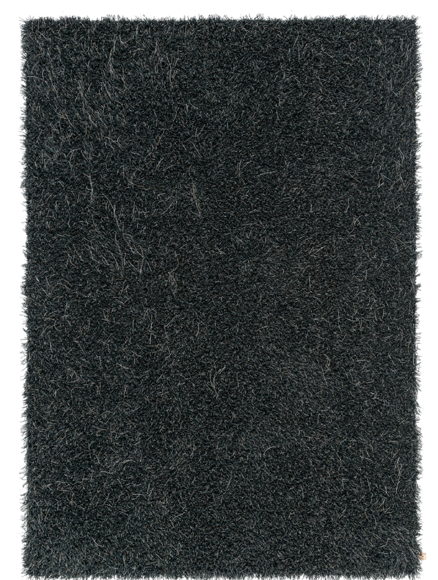
Rug 170x240 cm, Blue Iron 501