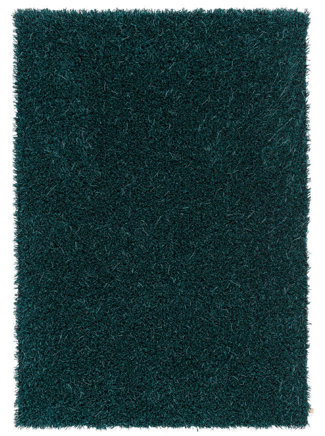
Rug 170x240 cm, Dark Turquoise 201