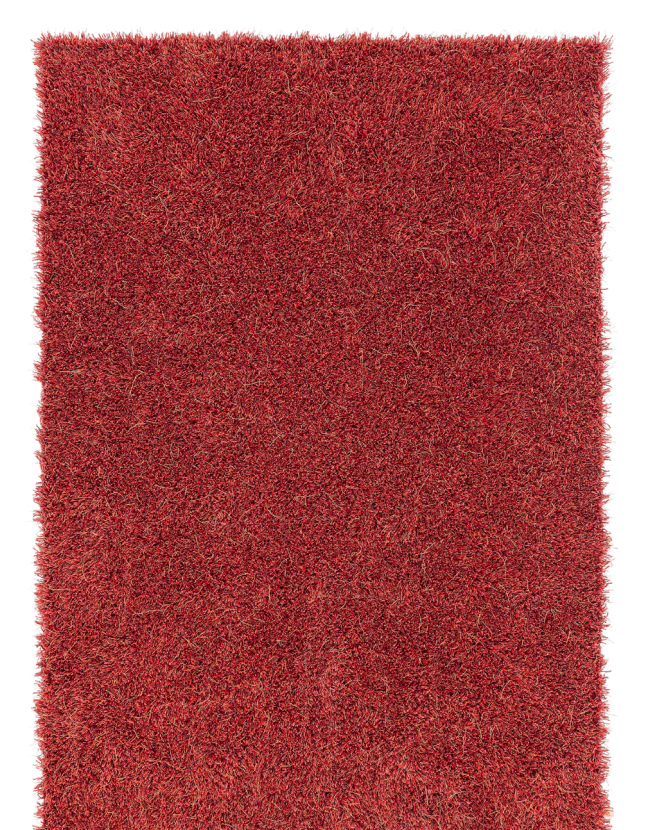
Rug 170x240 cm, Deep Coral 100