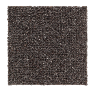
Cold Lava 8452