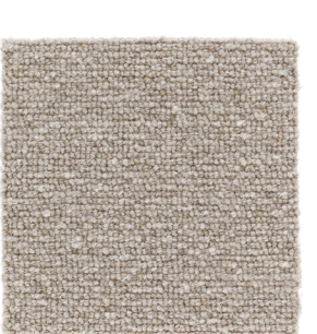
Drift Wood 8454