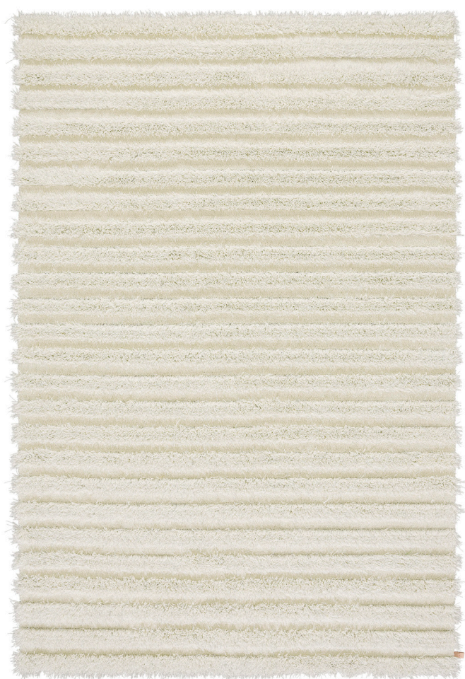
Rug 170 x 240 cm, Ghost 880