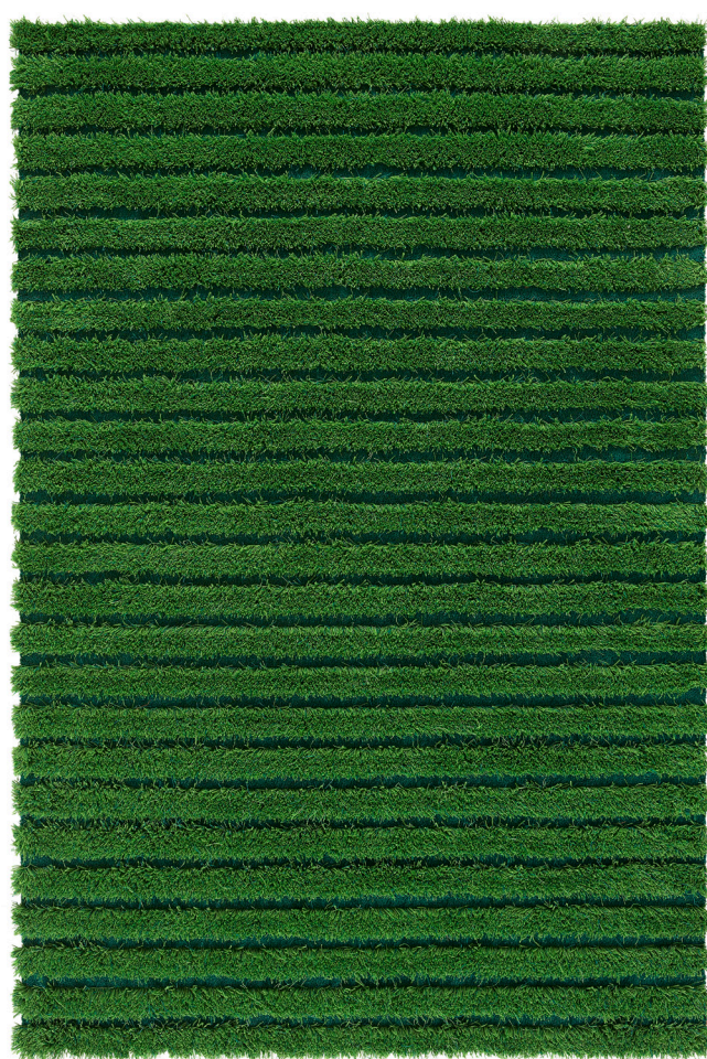
Rug 170 x 240 cm, Jungle 330