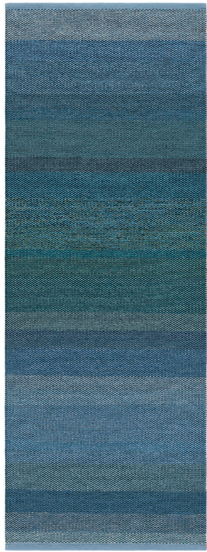
Rug 90x240 cm, Blue