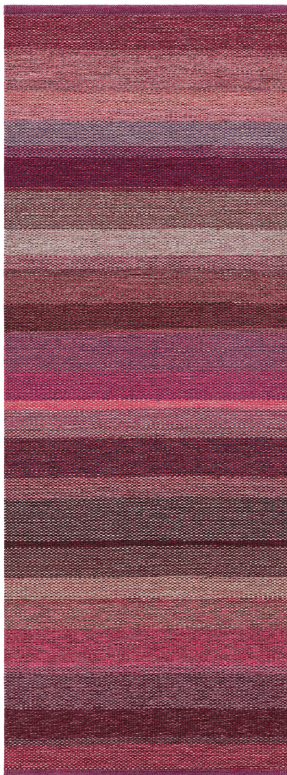
Rug 90x240 cm, Purple & Pink