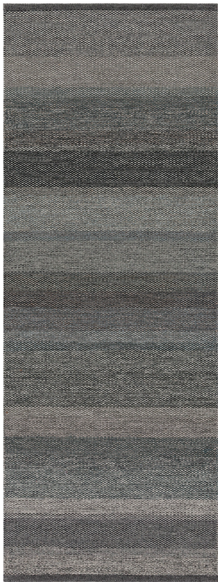
Rug 90x240 cm, Black & Grey