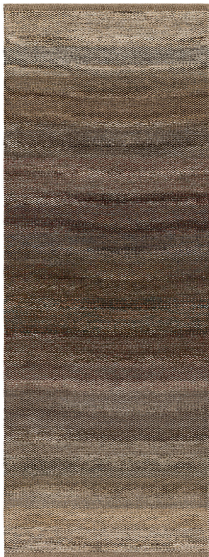
Rug 90x240 cm, Beige & Brown

Design KASTHALL DESIGN STUDIO / ELLINOR ELIASSON Woven rug made of residual yarn in pure wool