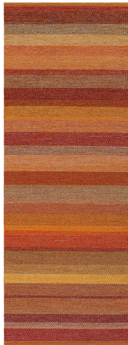
Rug 90x240 cm, Yellow & Red