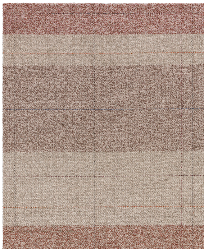
Rug 170x200 cm, Cinnamon 770