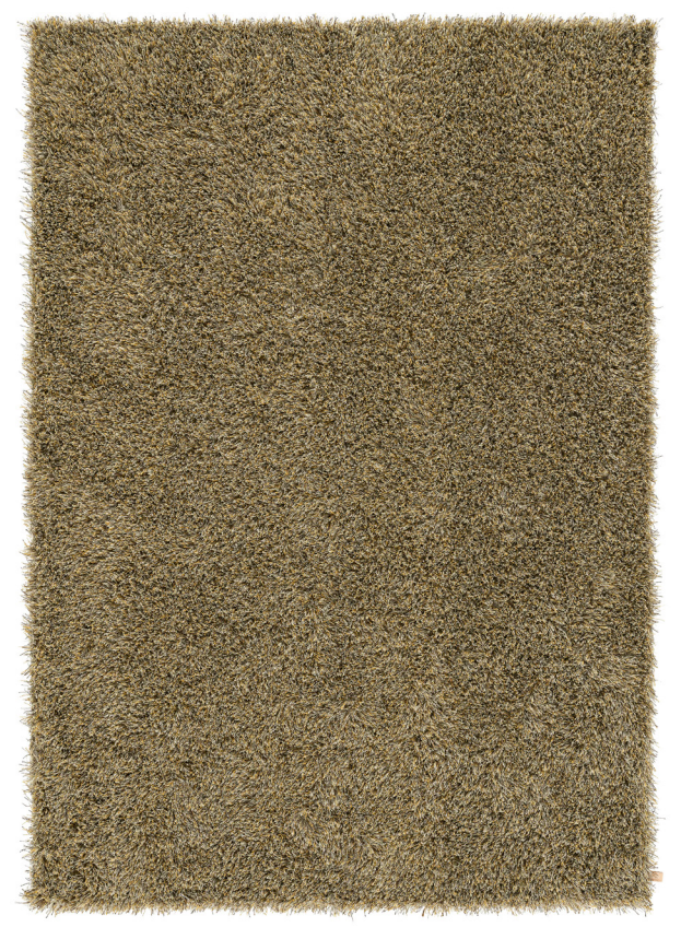
Rug 170x240 cm, Lemon Fudge 840