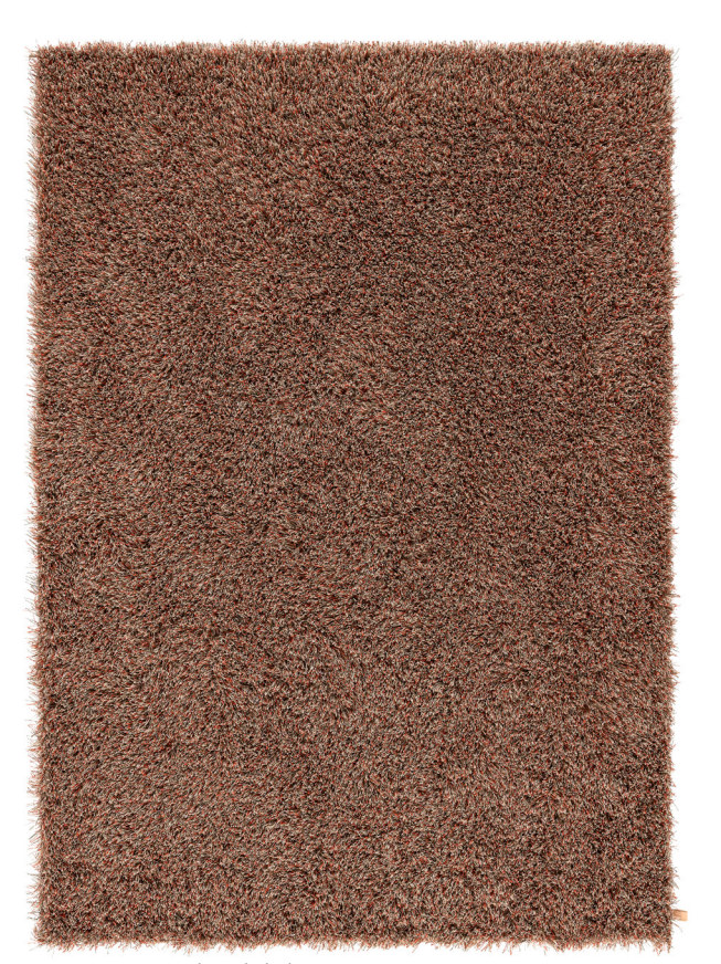
Rug 170x240 cm, Almond Blush 810