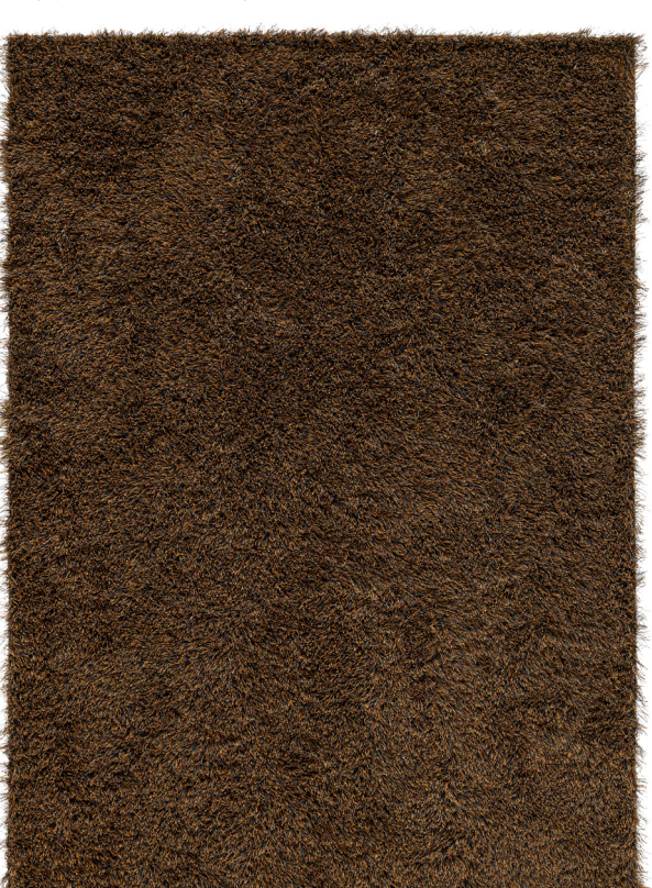
Rug 170x240 cm, Copper Blue 820