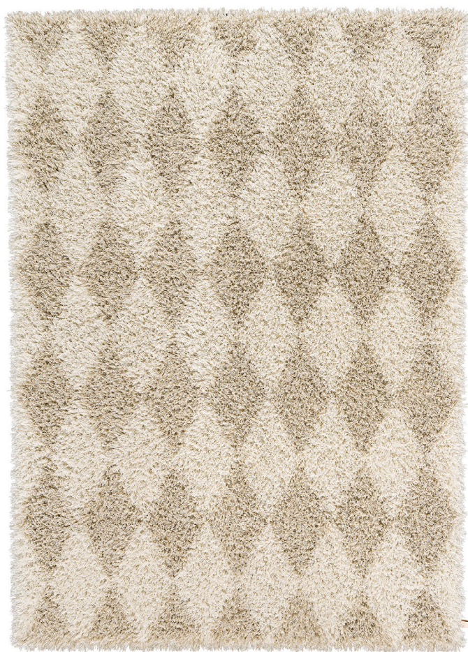
Rug 170x240 cm, Cream

Showrooms in MILAN | NEW YORK | STOCKHOLM | GOTHENBURG