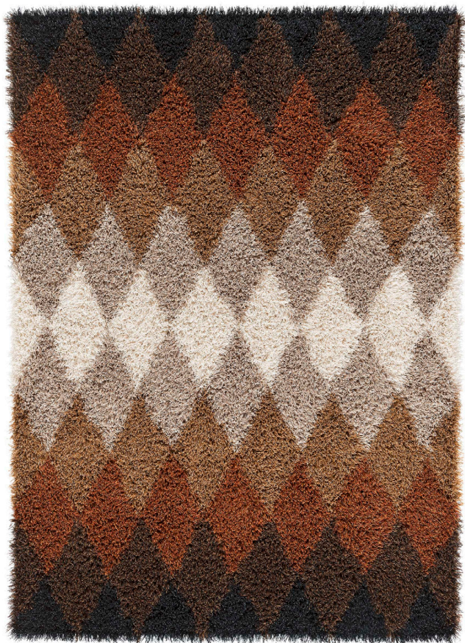
Rug 170x240 cm, Cognac

Design GUNILLA LAGERHEM ULLBERG Hand tufted rug in pure linen