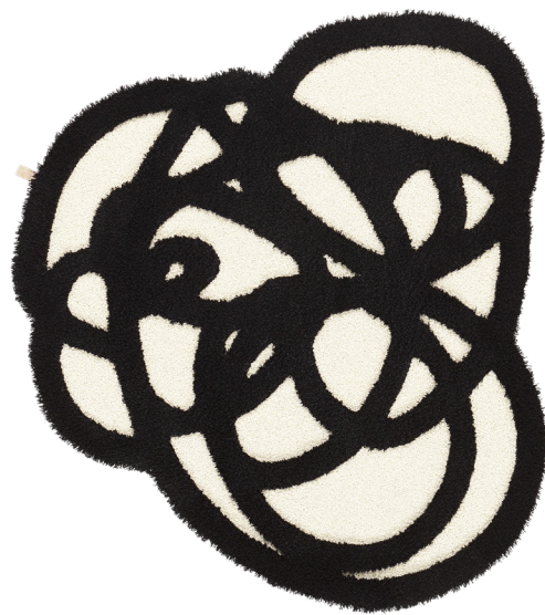
Rug Ø 120 cm

Showrooms in MILAN | NEW YORK | STOCKHOLM | GOTHENBURG