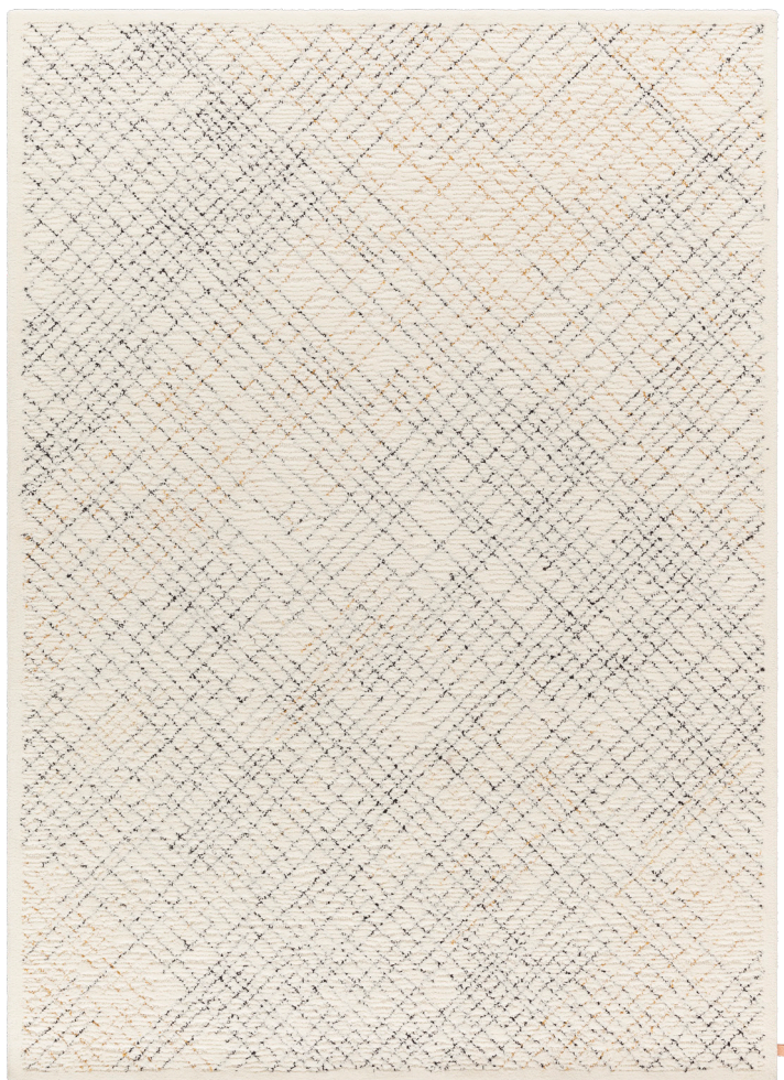
Rug 200x300 cm, White Diamond 500