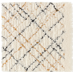
White Diamond 500