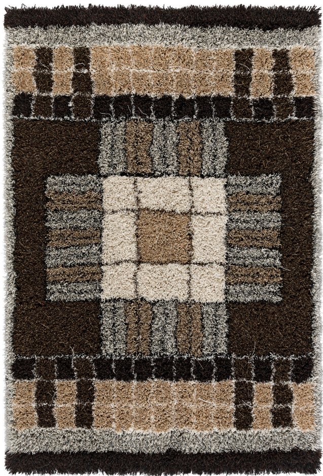
Rug 200x300 cm

Design INGRID DESSAU Hand tufted rug in pure wool and linen