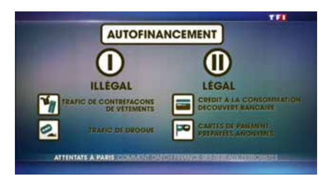
Attacks in Paris: How does Daesh finance its terrorist networks? Television news TF1 - 23 november 2015

Indeed, among the methods used by Daesh to finance its terrorist networks, counterfeiting, particularly clothes, hold a dominant position.