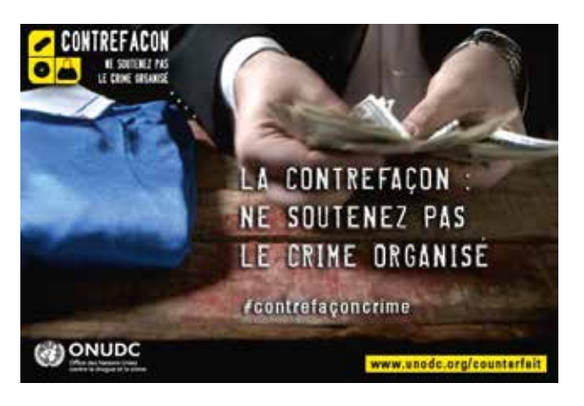
\label{lem:campaign} {\tt Campaign\,UNODC,\,"Counterfeit:\,don't\,buy\,into\,organized\,crime",\,See:\,http://www.unodc.org/counterfeit/fr/index.html}