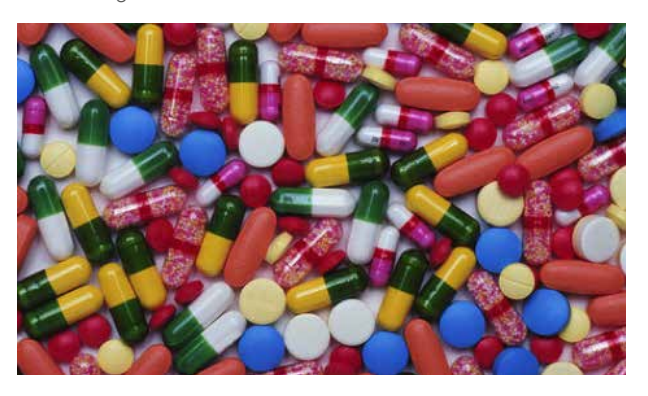
Study on counterfeiting of medicines, see http://tpe-medicaments.e-monsite.com/

Companies, which are the first targets of counterfeiters, are far from the only parties affected. Consumers, for whom counterfeit represents a real threat to their health and safety, should be aware and alerted about counterfeiting too because, being a part of the black market trade, it escapes from necessary checks to obtain legal certifications.