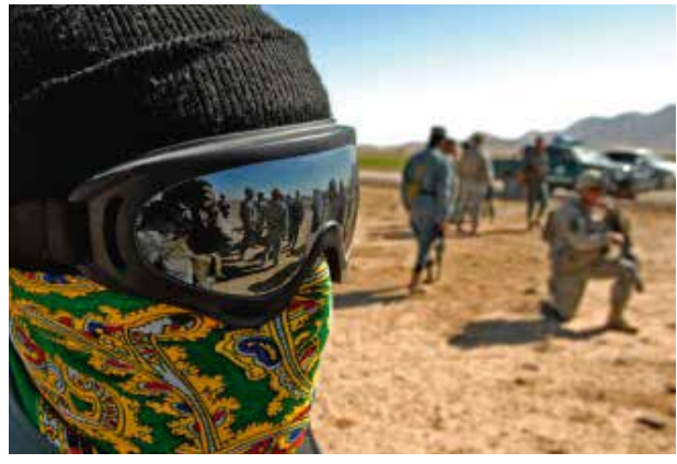
See: http://the diplomat.com/2012/07/is-let-turning-against-pakistan/

According to official Pakistani sources, 15%-20% of the budget of these terrorist groups in Waziristan is provided by cigarette smuggling and counterfeiting<sup>75</sup>.