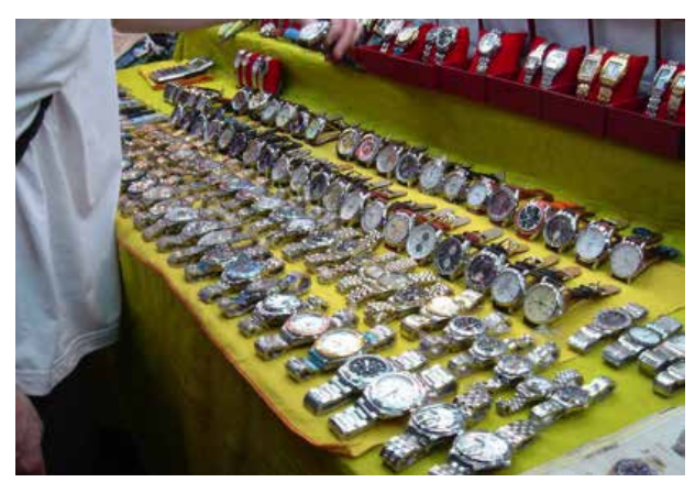
Counterfeit Market in Thailand, See: http://forum.horlogerie-suisse.com/viewtopic.php?t= 3050

The counterfeiter therefore aims to create confusion between the original product and the counterfeit product, in order to benefit from another's reputation or the result of investments made by the true holder of an intellectual property right. From a legal viewpoint, digital piracy (music, film, software, book, graphic) is therefore a form of counterfeiting, as is the production of fake brand items.