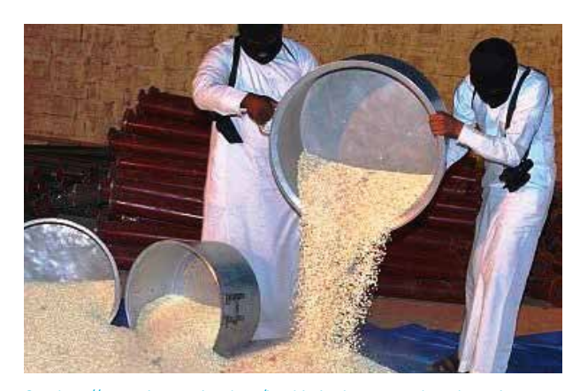
See: http://reseau international.net/la-chimie-des-coups-detat-les-printemps-arabe-et-le-putsch-de-kiev-ont-ete-accomplis-grace-aux-amphetamines-ces-pilules-de-lhorreur/

The traffic of this false product would seem to have become the nerve of the war in Syria. The recent peak in the traffic of Captagon pills in the Middle East would indeed be directly related to the conflict in Syria, according to the Lebanese newspaper "The Daily Star" and the American weekly magazine "Time".