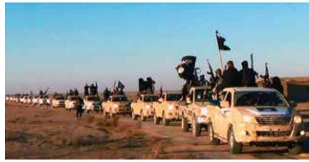
See: http://www.marianne.net/Etat-islamique-ou-quand-la-guerre-est-aussi-une-guestion-de-lexique a243562.html

Lastely, it should be noted that numerous french who wish to meet Daech in Syria, use counterfeit to fund their departure.