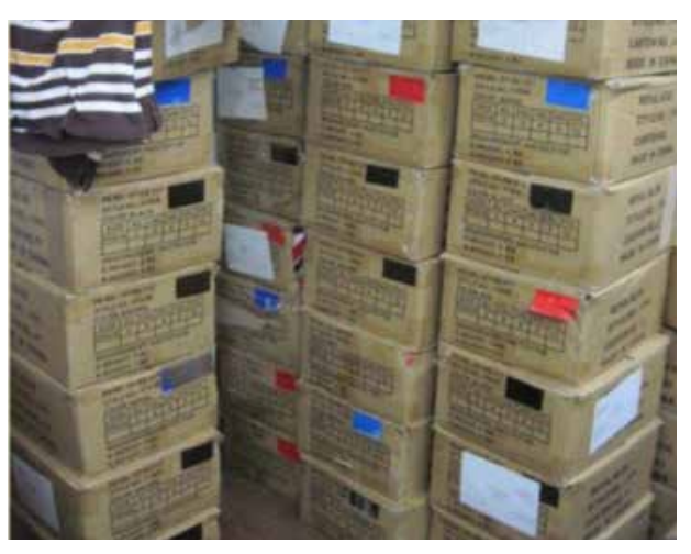
New-York- 2013- Seizure of a hundred of pants of different brands

Counterfeiters adapt the modus operandi and the shipment routes to every product and national legislations<sup>93</sup>.