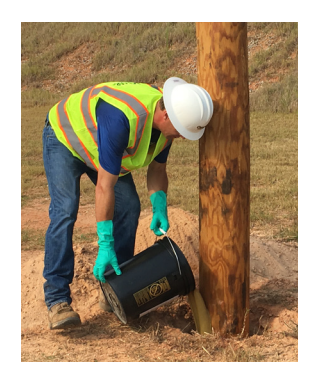
Step 3: Fill