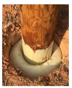
Step 4: Set