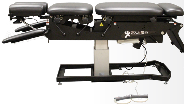
EH9400 with Options