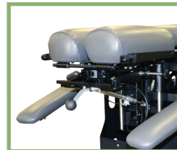
Headpiece: Tilt, Elevation, Forward Drop, Toggle Drop, Adjustable Face Cushion Options