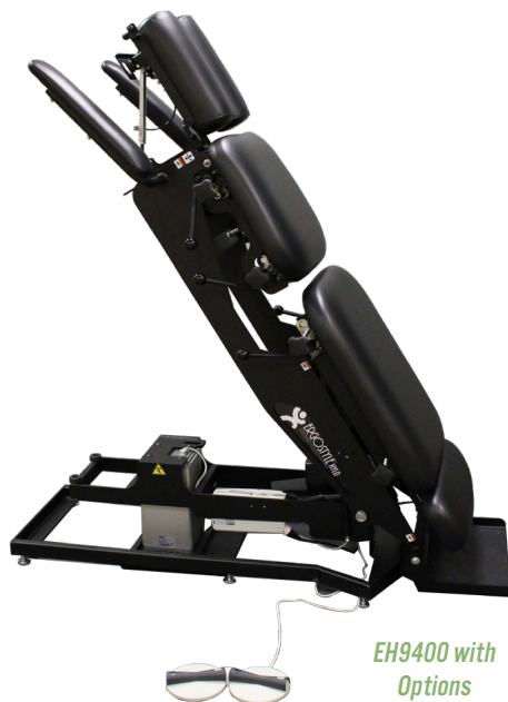
EH9400 with Options