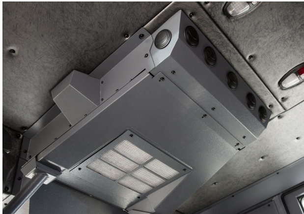
A metal HVAC cover is now available on the Enforcer cab.