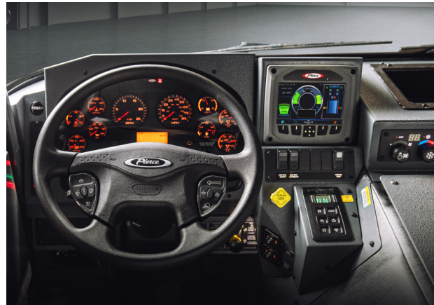
A robust metal dash is now available on the Enforcer cab.