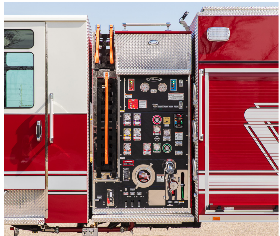
The 34" wide Control Zone pump panel is organized with color coded controls. The speelayes are integrated, providing pre-connects that are 43" and 66" off the ground - all on a 45" pump house.