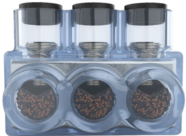
Conductor insertion and oxide inhibitor presence can be visually verified after installation.