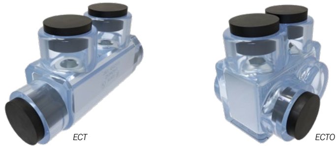
ClearTap® Two Wire In-line and Offset Insulated Splicer-Reducers