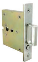
PD50 (2-1/2" / 2-3/4" Backset) PD50B (2" Backset) Lock Case with Edge Pull