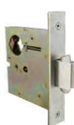
PD53 (2-3/4" Backset) PD53A (2-1/2" Backset) PD53B (2" Backset) Lockcase with Deadbolt NO Edge Pull, less Cylinder