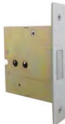
PD52 (2-1/2" / 2-3/4" Backset) Lockcase with built-in Dust Proof Strike for inactive pair of doors NO Edge Pull