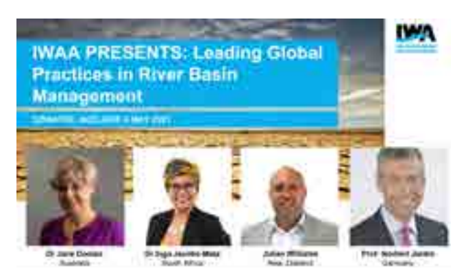
Focus areas: Governments & Stakeholders | Urban, Remote & Rural | Other Industry Sectors | Young Water Professionals | Indigenous Water