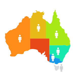
134 committee members across Australia