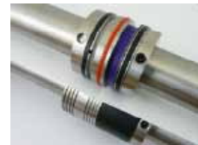
Crease & Perf