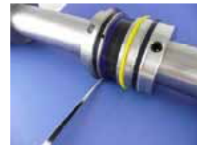
Crease & Cut