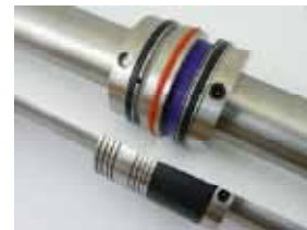
Crease & Perf