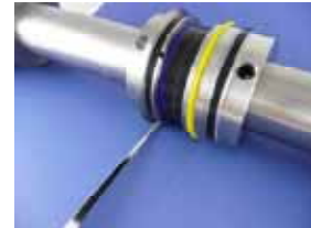
Crease & Cut