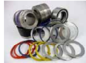
Full Multi-Tool Combo